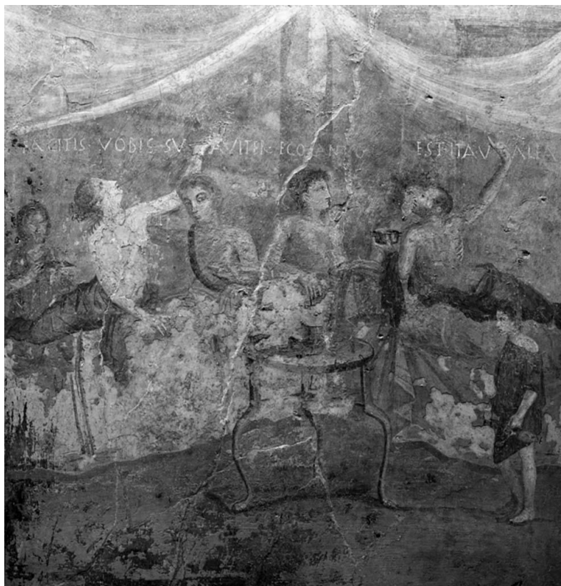
Fig. 6: Second fresco, north wall of the triclinium. Frescoes depicting a dining scene. House of the Triclinium, Room 15, Region V.2.4, Pompeii.

not clear on the basis of clothing, than their lower status was at least emphasized in these wall paintings by depicting them smaller than the ones dining. Another interesting element in this fresco is that the two guests in the front are wearing shoes, while the servants are walking barefoot. Besides the possibility that this was an indication of lower status, it might also refer to the fact that these servants are part of this household, while the ones wearing shoes are guests from outside. Thus, it also shows a difference in dress in the public and domestic sphere.