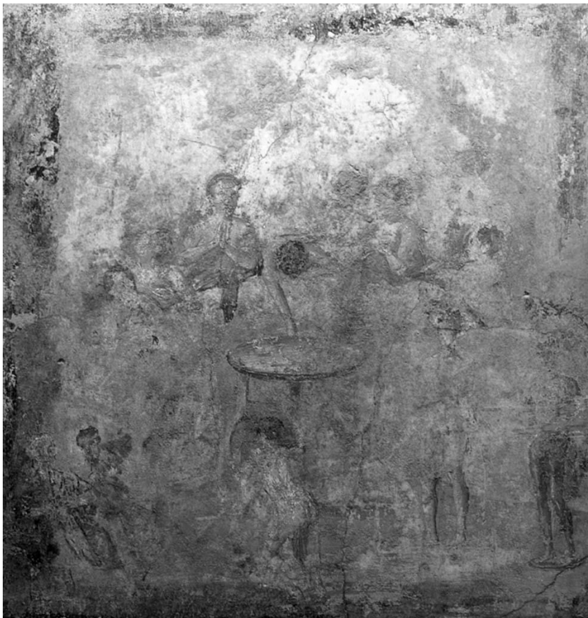
Fig. 7: Third fresco, west wall of the triclinium. Frescoes depicting a dining scene. House of the Triclinium, Room 15, Region V.2.4, Pompeii.