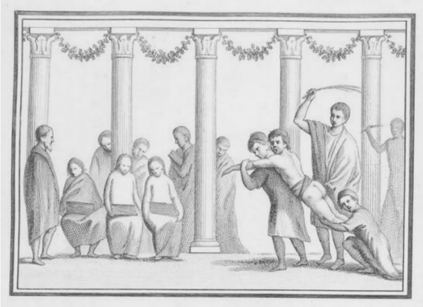
Fig. 4: Fragment depicting pupils and punishment. Source: Tomo Terzo, Le Pitture Antiche D'Ercolano Vol. 3 (Naples 1755-92).

In figure 4 there are three people seated on the left who are holding tablets in their hands. This indicates that they are pupils, and that the Forum might have been the place where education took place in Pompeii. On the right we see someone who is punished in public. 45 Some historians have suggested that this person was a pupil as well. He misbehaved and was therefore punished in front of the other pupils as a deterrent. 46 However, there is no direct connection visible between the two groups. Thus, another way of interpreting this fragment could be that there is in fact no relation between the two, but that it merely shows what could take place on the Forum. This seems more plausible, since the different fragments were in fact once one painting covering the walls of a room in the Praedia of Julia Felix. Thus, this particular fragment, and therewith the scene it depicts, is actually created by the excavators.