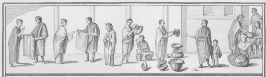
Fig. 2: Fragment depicting buyers and sellers.

which was decorated with a long fresco that continued on the various walls. This wall painting from 62-79 CE shows (idealised) daily life events taking place on the Forum in Pompeii. 35 Some fragments of this fresco were removed from the wall. The ones which were left behind are badly preserved due to the excavation methods of that time. The pieces which were taken from the house are very faded. Fortunately, there are engravings of the fragments of the Forum fresco from the eighteenth century, which enables us to study them. 36 Due to the existence of many fragments, once forming a large fresco, only a selection that most clearly deals with this article's subject matter will be discussed. 37