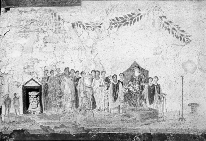
Fig. 1: Procession of Cybele, On the outside wall of a shop, Region IX.7.1, Pompeii.

In this wall painting (figure 1) the goddess Cybele is visualised by a wooden statue, at the front of the procession, visible on the right. This effigy was dressed and decorated by the devotees and then paraded throughout the city during the procession. Cybele is seated and wears a white tunic. On top of that she wears a long purple garment, which is draped in a Greek style. Hereby, she is distinguished from others in the scene and the style of her dress might have referred to her oriental origin. Furthermore, she has a crown on her head which depicts the city walls, reflecting her role as protectress. 15