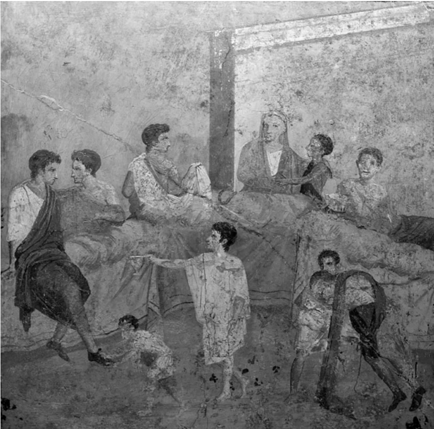
Fig. 5: First fresco, east wall of the triclinium. Frescoes depicting a dining scene. House of the Triclinium, Room 15, Region V.2.4, Pompeii.

In the first wall painting (figure 5) one guest just arrives while others are already lying on the couches. The servants are busy with taking care of the guests. All figures on this wall painting are men, which is not the case for the other two frescoes. In this first fresco four male servants, probably enslaved people, are depicted. Three of them are standing in front of the couches, all wearing short white tunics with vertical red-purple stripes. The one on the left is taking off the shoes of a guest, while the one in the middle offers him a drink. The servant on the right is helping a (drunk) guest who is about to