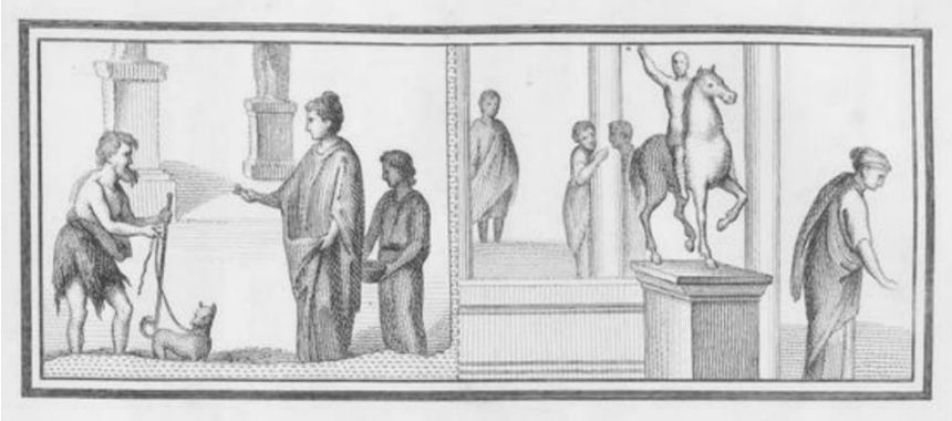
Fig. 3: Fragment depicting a lady and a beggar.

In this fragment (figure 3) we see a completely different scene. On the left, a lady, next to a child or servant, seems to give something to the man who has a dog along his side. He is standing a bit bent forward, supporting himself with a stick. 43 Furthermore, he wears a rag, leaving one arm and his legs mostly exposed. In contrast to the other men on the fresco fragments, the beggar is the only one with a beard and wilder, uncut hair. All this points to the fact that he is poor and probably a beggar. In contrast to the man, the woman on his right is almost fully dressed in a stola , which is a longer second tunic worn over the first, shorter tunic. This garment is very long – it reaches the floor – which suggests the lady was of a higher status. Moreover, stolae were worn by matrons , wives of Roman citizens. 44 The stola symbolised a woman's status of chastity and morality and is often interpreted as the female equivalent of the male toga . This visible contrast in appearance between the two thus helps to tell a story, possibly a moral one: one of beneficence. A value closely connected to, and to some extent even expected of, the elite.